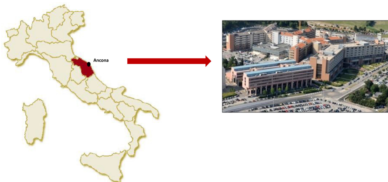
Figure 1. Location of AOU Ospedali Riuniti di Ancona, reference hospital of Marche Region.

The AOU Ospedali Riuniti di Ancona has been considered as the most suitable institution to host the Cancer Center, due to its leading role as a highly specialised hospital and given its integrated reality with the Università Politecnica delle Marche. cancer and research center of marche(CORM) was established at the Department of Oncology of the AOU Ospedali Riuniti di Ancona under the patronage of the Ministry of Health